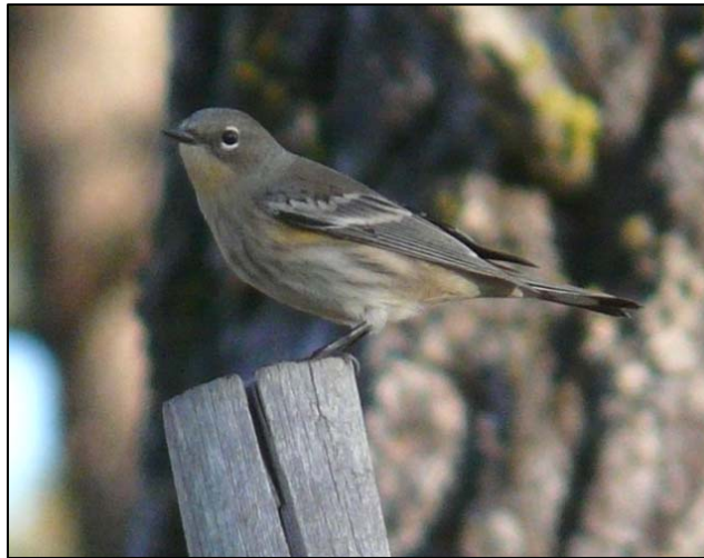
Yellow-rumped Warbler(female).