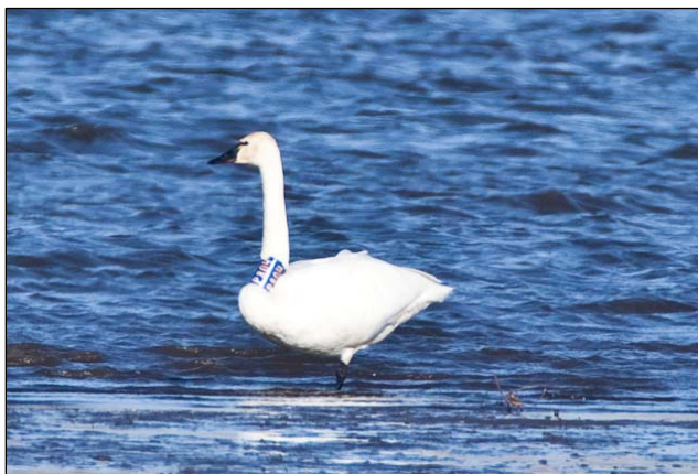
Tundra Swan.

On October 31, 2009 I was birding along the east end of the main reservoir at Cold Springs National Wildlife Refuge. Near the shore was a flock of about 20 Tundra Swans. As I observed them, I noticed one had a neck collar and since I had my camera with me I snapped several pictures. Luckily I could read the collar and after a quick check on the Internet found information for submitting the band number at www.reportband.gov . As I was filling out the required information I was intrigued to note the USGS still refers to this species under its old name "Whistling Swan".