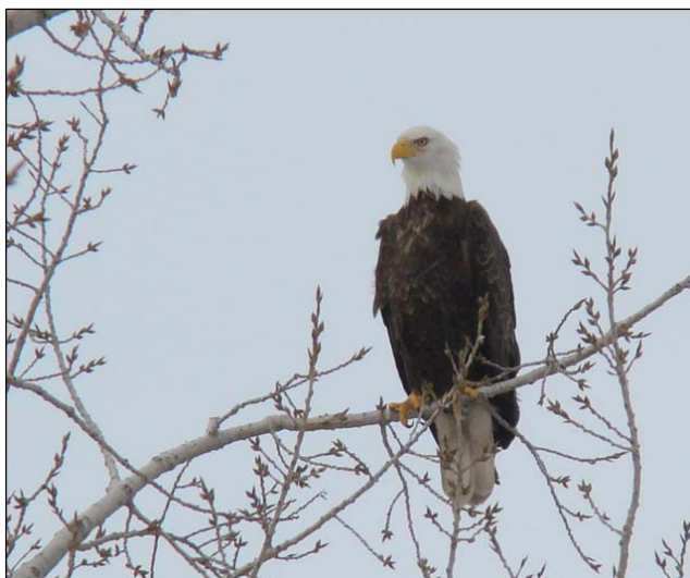
Bald Eagle.

While some eagles seem to prefer fish, other individuals seem to feed mainly on carrion, including road-killed deer. Eagles that winter at Cold Springs NWR seem to focus mainly on waterfowl as their principal food source which is another factor adding to the increased local wintering