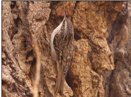
Brown Creeper.

Pied-billed Grebe, and Double-crested Cormorants. Birdseed was left at the main parking area and a few White-crowned Sparrows, Golden-crowned Sparrows and Juncos enjoyed the feast.