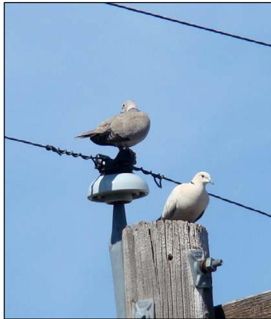
Eurasian Collared-Dove.