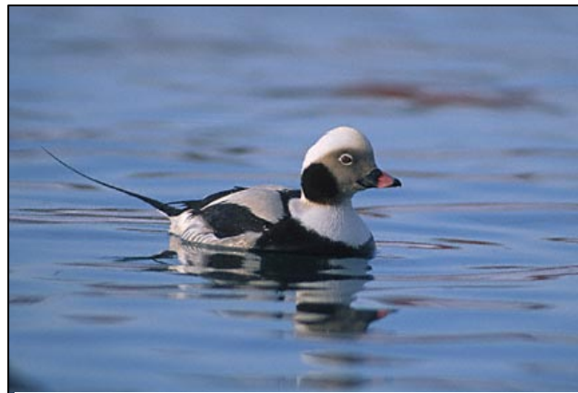
Long-tailed Duck.