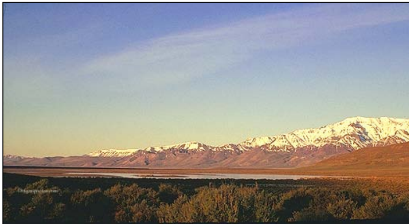
Looking at Steens Mountain from the Alvord Desert floor.

The Malheur area is a wonderful place to visit any time, but September is very special. Birding is wonderful; we usually see 130 to 140 species on a long weekend. A highlight is going up on the