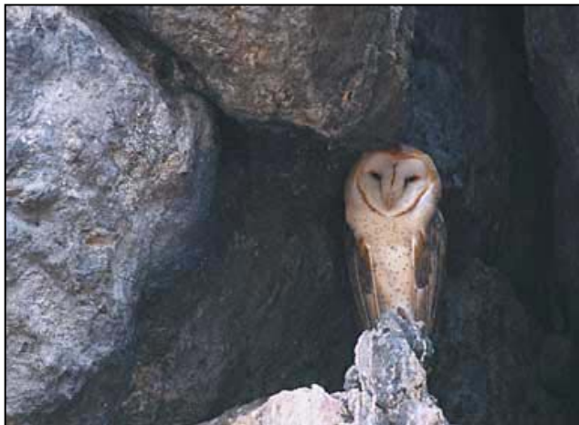
Barn Owl.

Barn Owls are birds of open country, farmland or grassland, usually at fairly low elevations. They hunt by flying low and slowly over an area of open ground, hovering over spots that conceal potential prey. With extremely acute hearing and ears placed asymmetrically, they do not require sight to hunt. Hunting nocturnally or crepuscularly, it can target, dive, and penetrate its talons through snow, grass, or brush to seize rodents with deadly accuracy. Compared to other owls of similar size, the Barn Owl has a much higher metabolic rate, requiring relatively more food. Pound for pound, Barn Owls consume more rodents than possibly any other creature. Farmers find these owls more effective than poison in keeping down rodent pests. Barn Owls, however, were persecuted, as were many raptors, due to a lack of knowledge of their behavior and diet. Rodent poisoning and diminishing habitat are further threats to the Barn Owl. 4