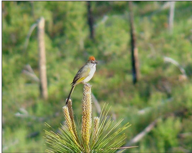
Green-tailed Towhee.

Traveling back up the mountain and past Tollgate, the birders stopped at the Bald Mountain overlook. A male Green-tailed Towhee was easily seen as he perched in dead branches on the slope below the overlook. While looking at the towhee, Diana LaSarge spotted a Calliope Hummingbird perched on a branch just above the towhee. It is possible the hummer was being territorial about the field of wildflowers that covered the hillside. A female Black-chinned Hummingbird was also seen flitting around the penstemons, paintbrush, larkspur, scarlet gilia, and other flowers. There was no lack of food for the hummers at this location! A Turkey Vulture and a Red-tailed Hawk soared in the canyon below