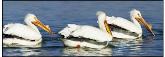
American White Pelicans.

American White Pelicans continue to be seen in the area. On June 22, Lorna Waltz reported 25 American White Pelicans flew down the Umatilla River and landed in the river at the foot of NW 8 th Street in Pendleton. Lorna noted the birds rested in the area for over two hours before taking off, gaining elevation and flying east.