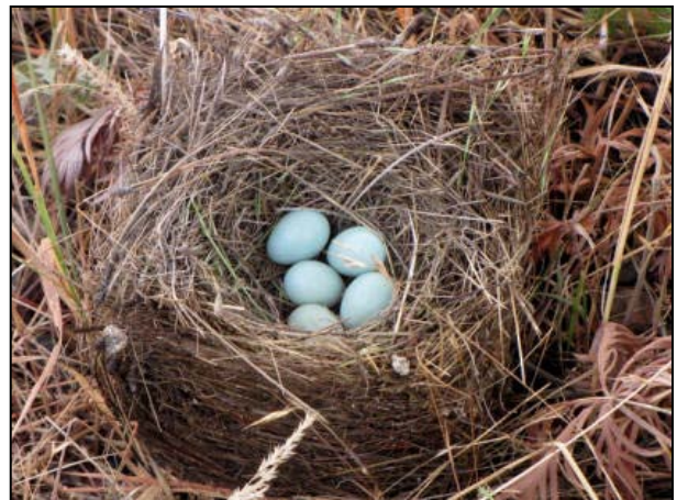
Western Bluebird eggs (deceased while in the box).

The last date that the Albee Bluebird Trail was monitored was Wednesday, July 1 st . On that date we observed 31 nest boxes with bluebird nesting activity. Of the 31 nests, 20 were determined to be “first hatch” nests with 14 eggs, 15 chicks and a whopping 92 chicks presumed fledged since Mar 21 when our monitoring began. There were 11 nest boxes which