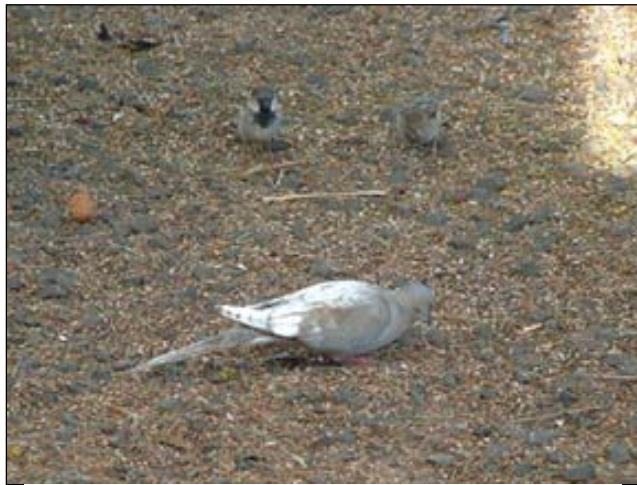
Leucistic Mourning Dove.

There was nothing unusual about the behavior of this dove (it was courting females); however, its unique coloration suggested it might be a weird hybrid or perhaps had flown through a bucket of white paint. I grabbed my camera and snapped a few pictures (see photo). The dove remained in the neighborhood for 2 to 3 weeks then disappeared. We